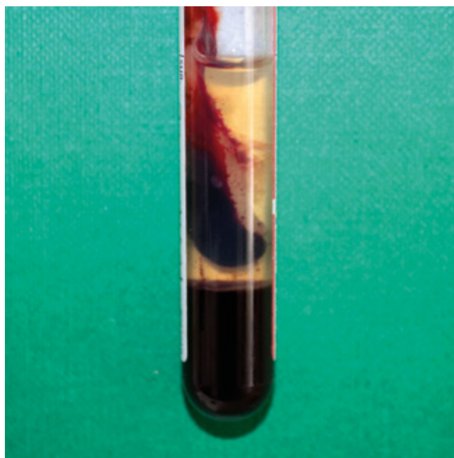
Normal blood sample

Donkeys are particularly susceptible to hyperlipaemia. They have adapted to live in harsh environments with sparse, poor-quality vegetation, and would naturally walk for up to 16 hours a day in search of food. As a result, donkeys living on relatively lush pasture with limited exercise tend to gain excess fat. If these animals stop eating for any reason, hyperlipaemia may develop.